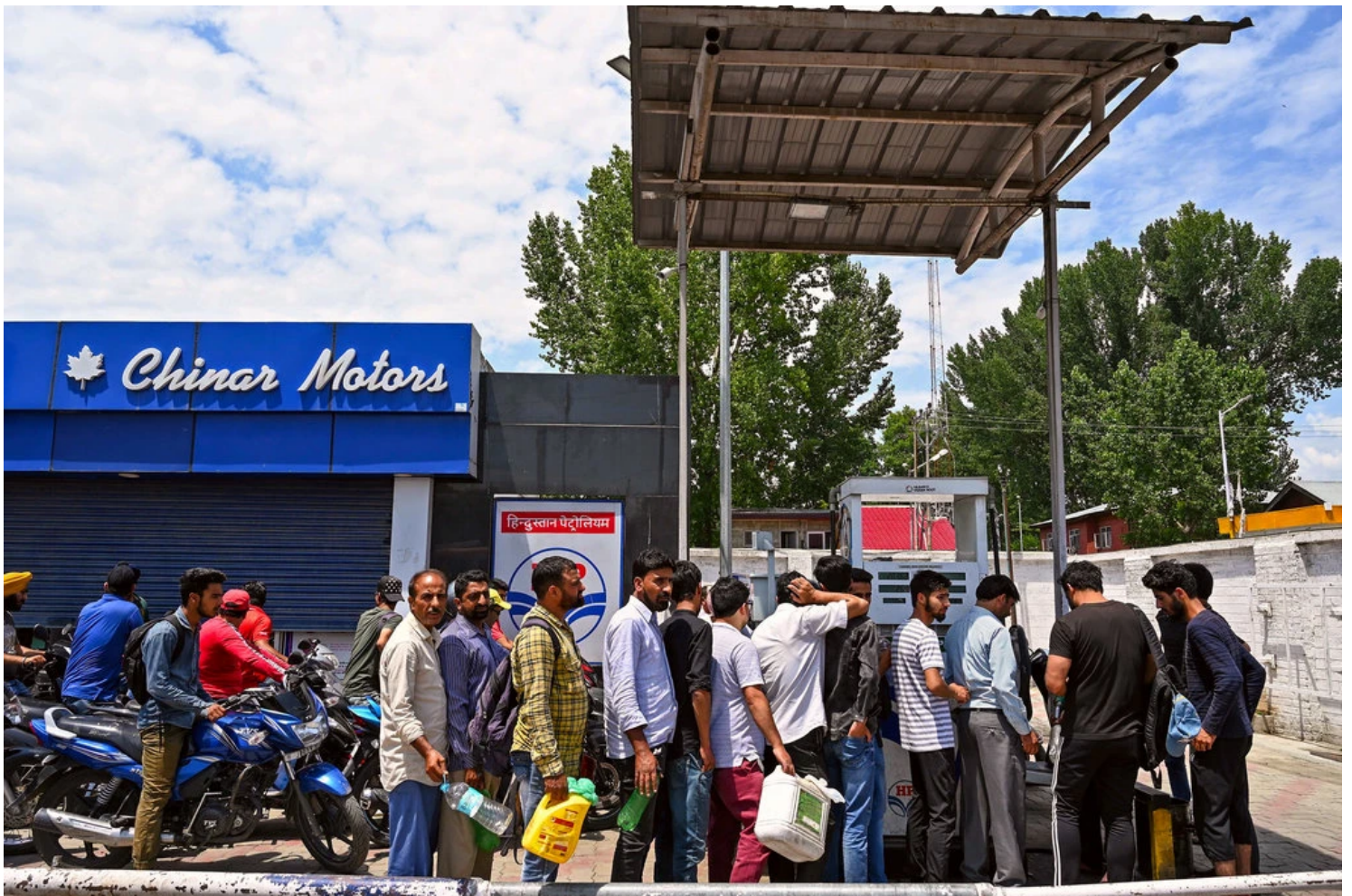
A line for gas in Srinagar.