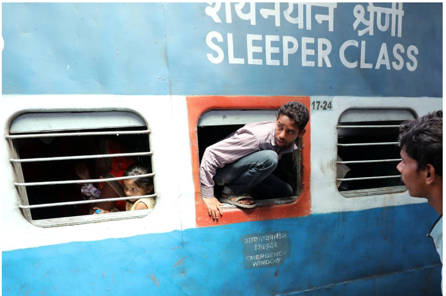
Indian migrant laborers fleeing Kashmir by boarding a train through an emergency window.