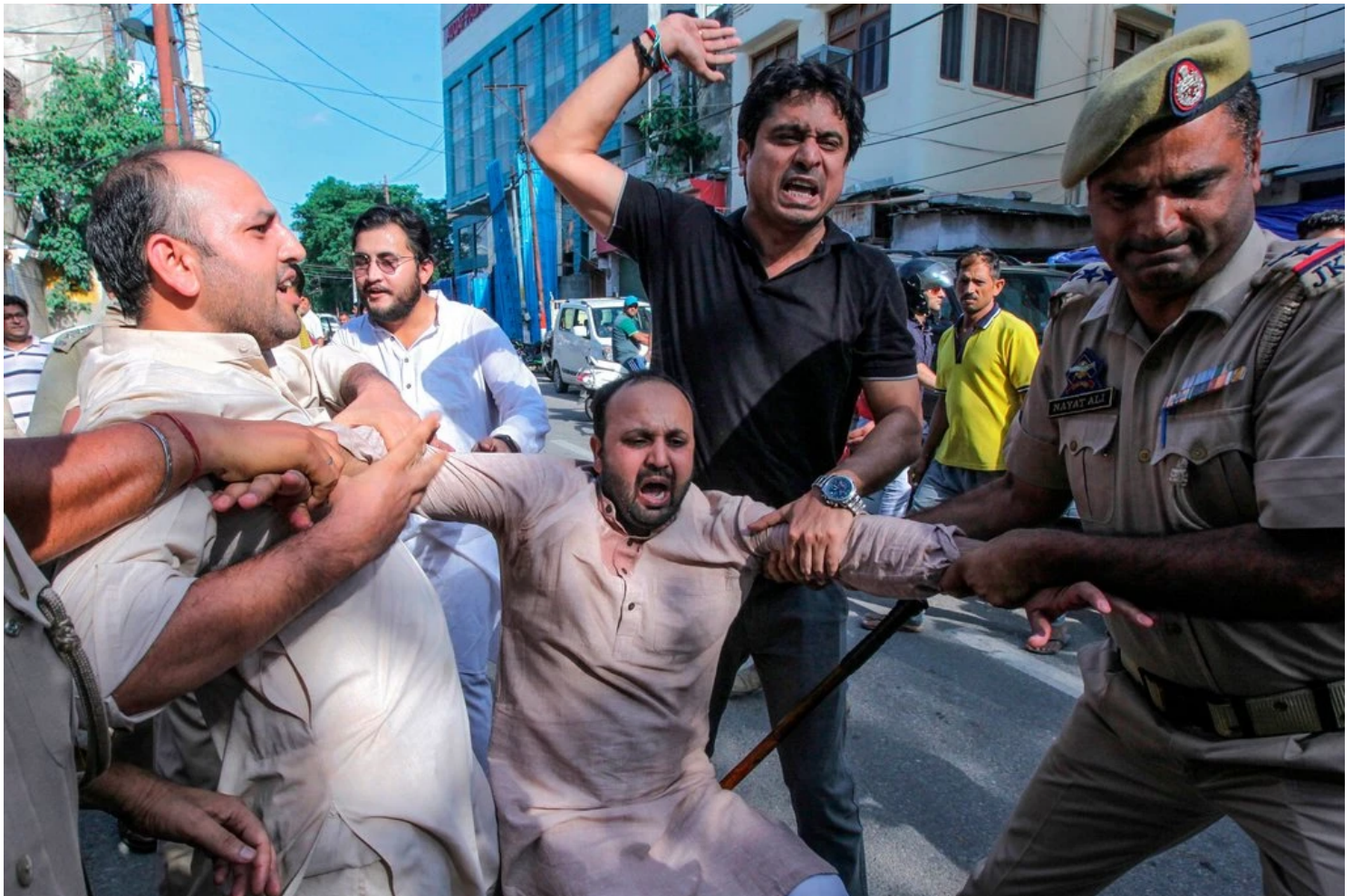
The police detaining an activist during a protest against the Indian government in Jammu on Saturday.

Despite the crackdown, protests have erupted. On Friday, the unrest continued, gunshots rang out and foreign journalists continued to be barred from entering Kashmir without permission. These pictures are some of the first images to emerge, taken by Indian photographers who managed to work around the communication blockade and the miles of razor wire to take and publish their images.