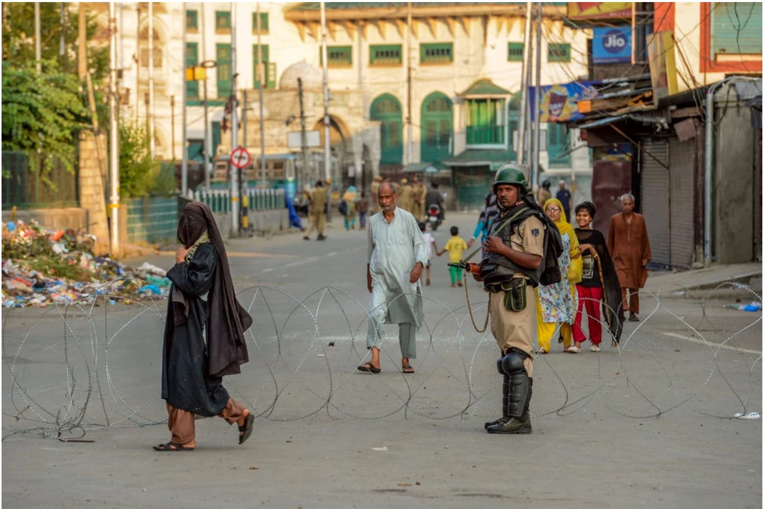
Some Indian news outlets have reported that families in Srinagar are beginning to run out of food.