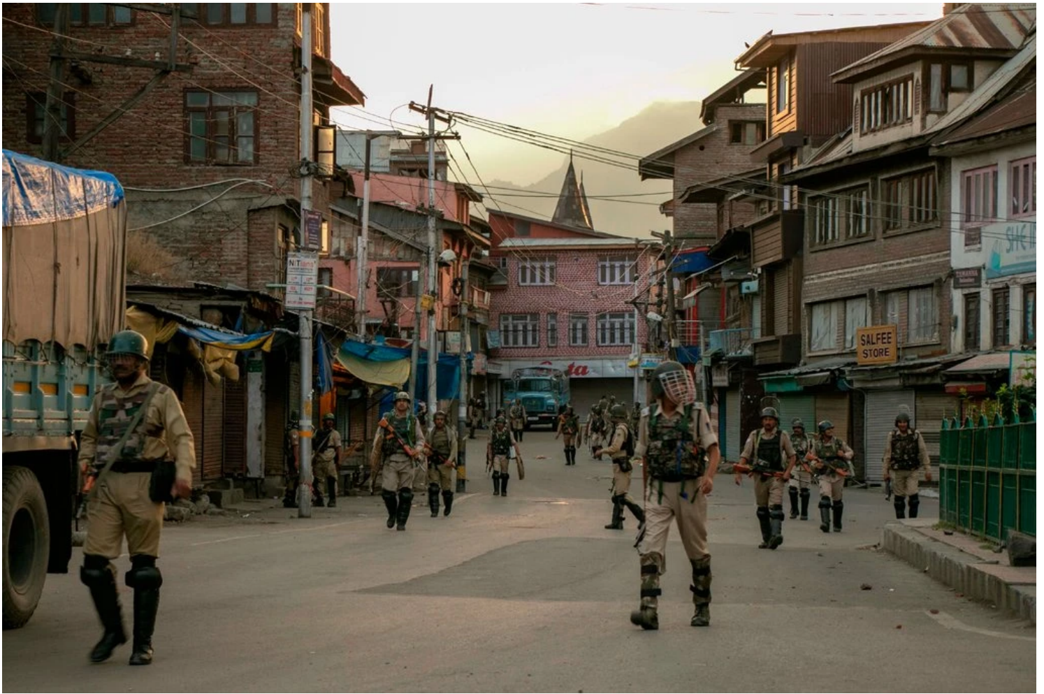
Indian security personnel on a street in Srinagar on Friday.