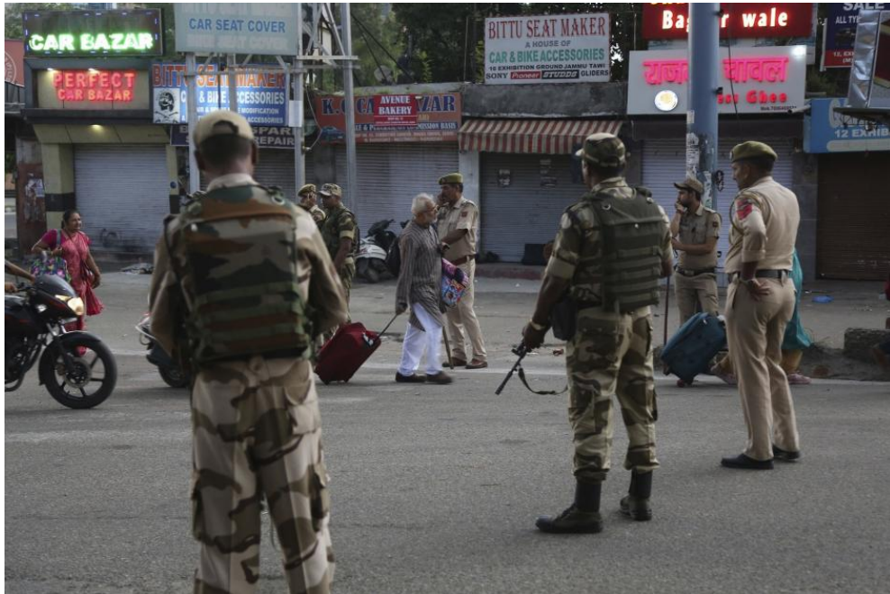
Tourists walk past Indian security forces during curfew like restrictions in Jammu, India on Monday, August 5, 2019. An indefinite security lockdown was in place in the Indian-controlled portion of divided Kashmir on Monday.

(New York) – Indian authorities have adopted measures in anticipation of unrest in Jammu and Kashmir state that raise serious human rights concerns, Human Rights Watch said today. The government announced on August 5, 2019 that it was altering the special constitutional status of the state.