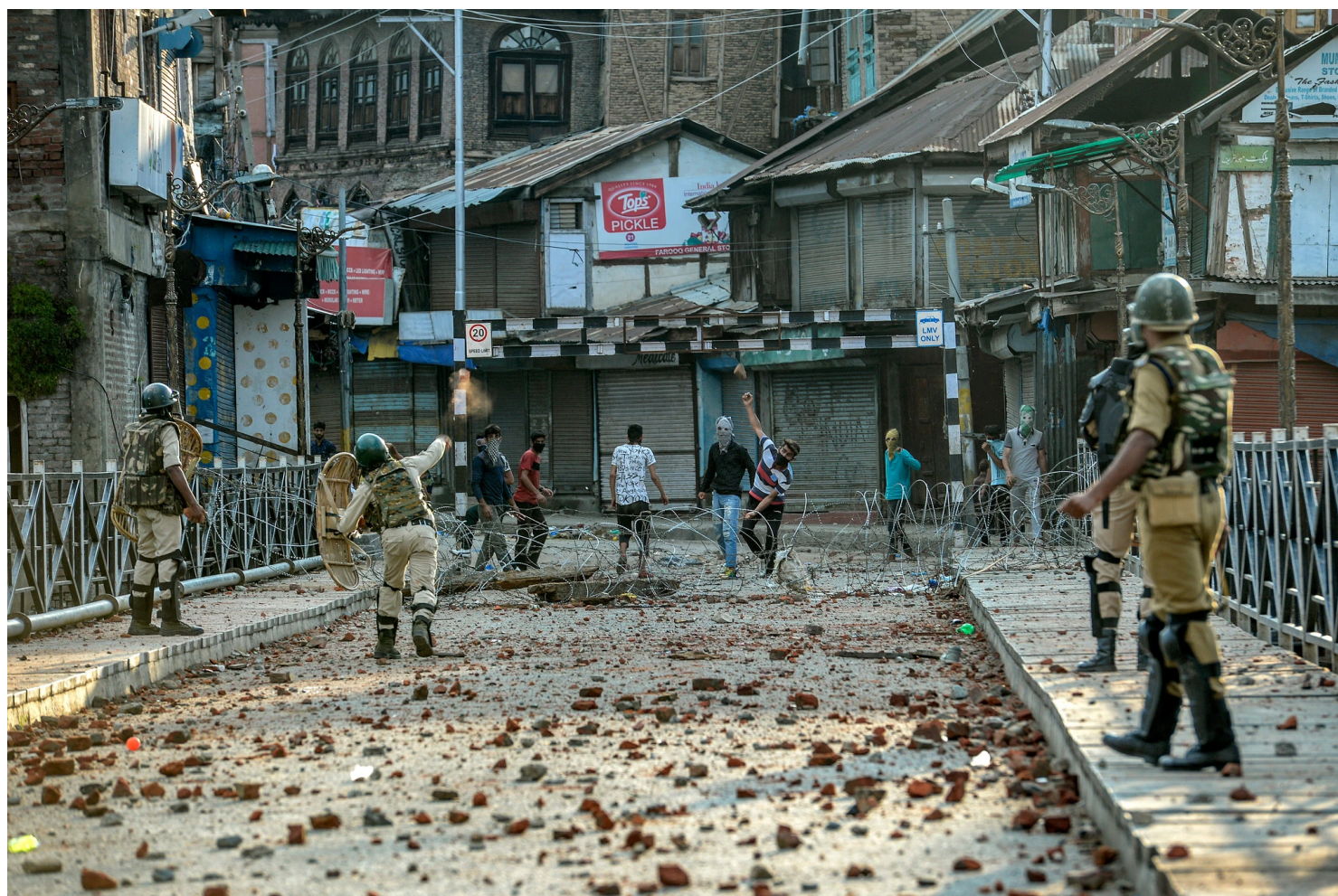
Protesters throwing stones in Srinagar, in Indian-controlled Kashmir, on Thursday.

NEW DELHI — For most of the past week, the entire Kashmir Valley, home to about eight million people, has been put on virtual house arrest.