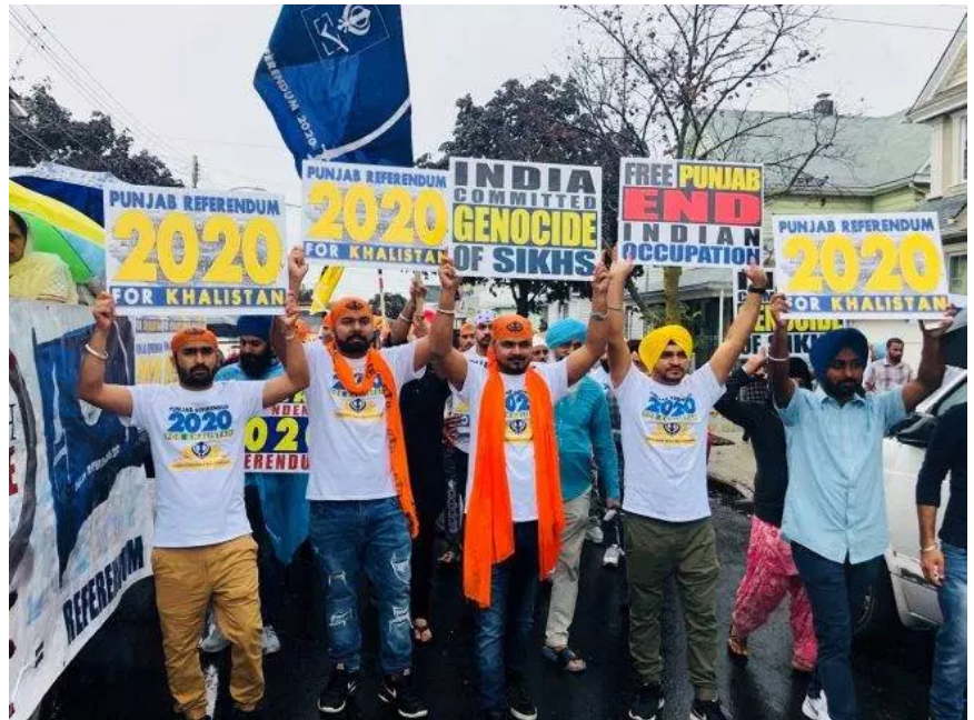
Sikhs attend a rally calling for a referendum on the creation of a Sikh state called Khalistan, Sept. 9, 2018 in Brampton, Ont.