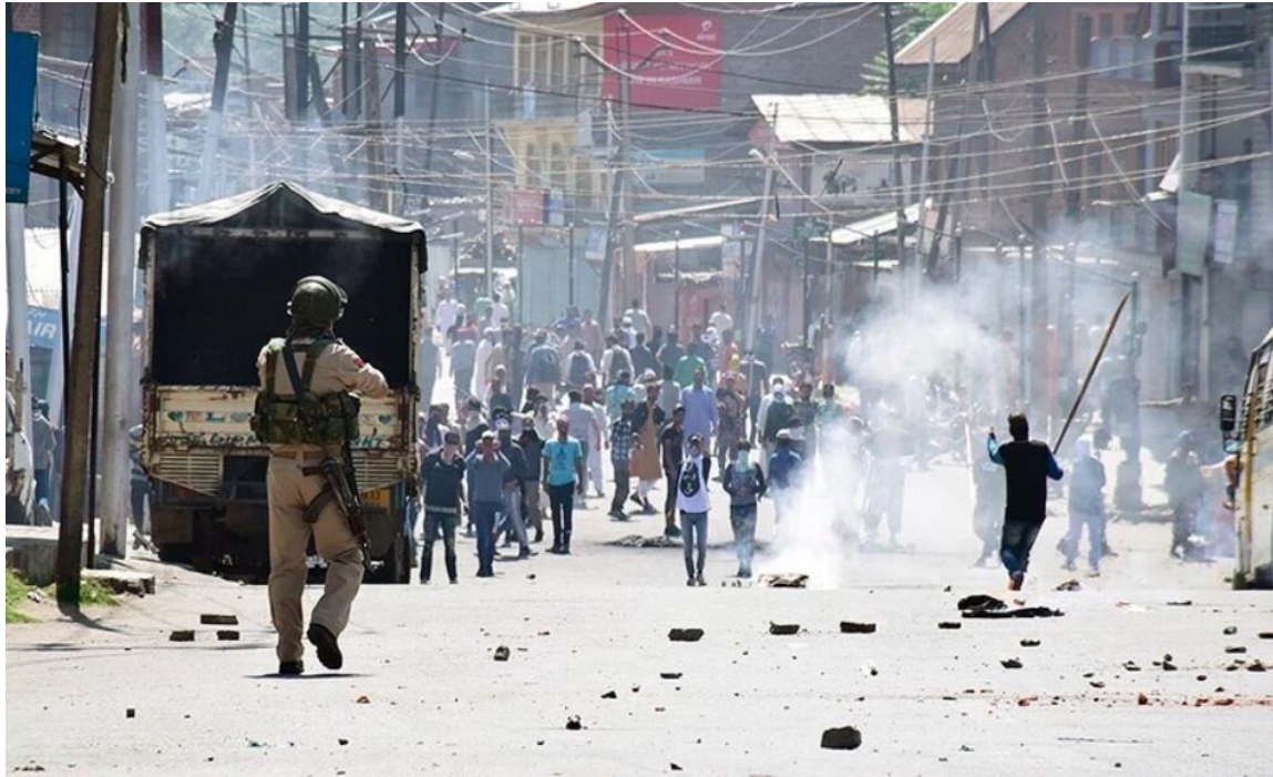
Police in Kashmir confronting protesters in December 2018. The new plan by India to take full control of Jammu and Kashmir will remake the map of the Himalayan border areas. Pakistan is working on bringing the highly disputed action by India into the UN Security Council.

It has always been relatively easy for Indian governments from both the political left and right to keep Kashmir from the eyes of the world. At no time has this been more obvious than now. Landlocked, under the guns of half a million Indian troops and paramilitaries, cut off sporadically from all modern communications and portrayed as a nest of Pakistani-backed Islamic terrorists, Kashmiris have suffered in isolation.