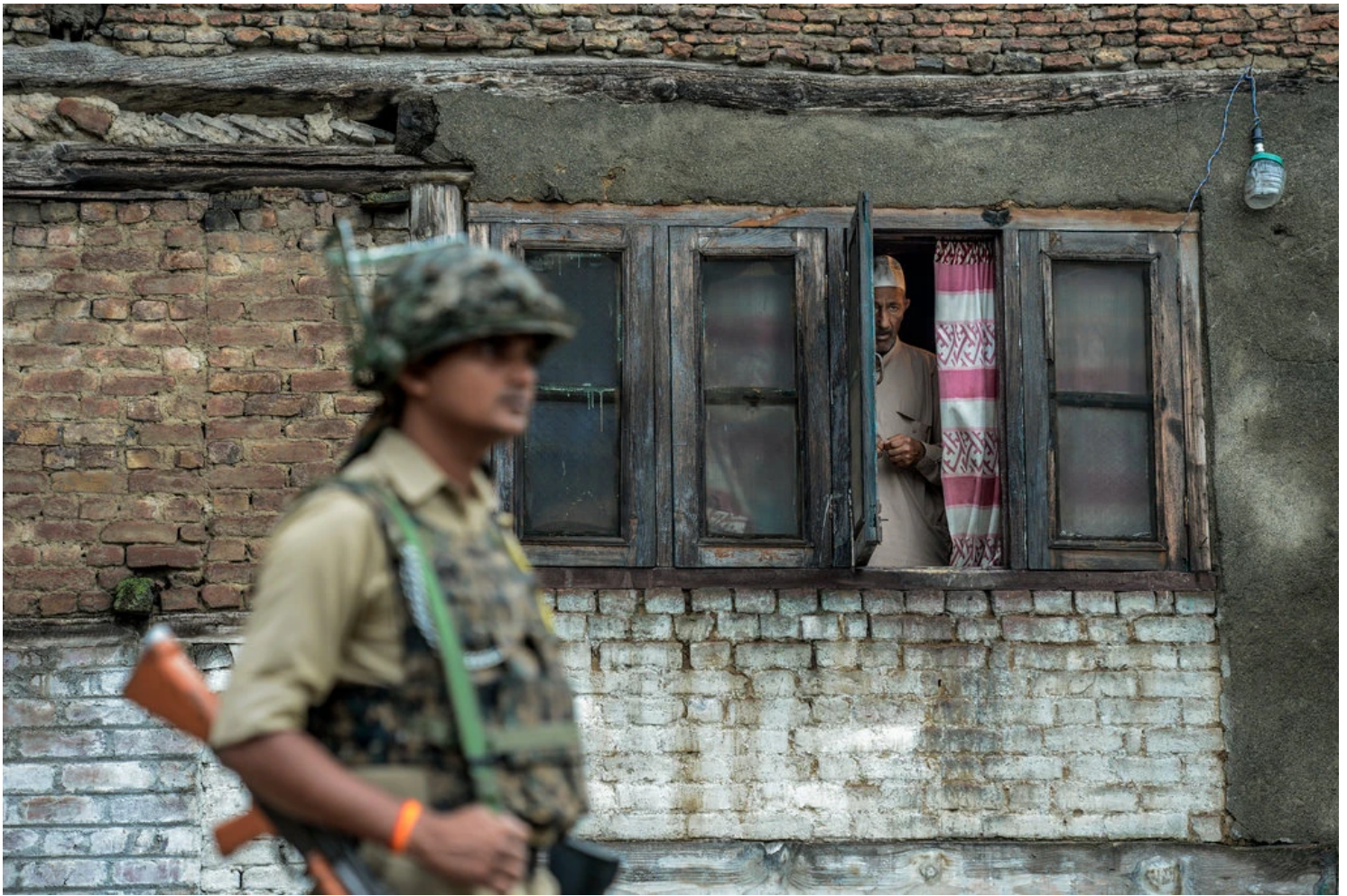
A resident looked out a window as soldiers patrolled the street below.

Kashmir is an exquisitely beautiful, staggeringly fertile land. Its meadows are carpeted with wildflowers, its white-toothed mountains push up against a flawless blue sky.