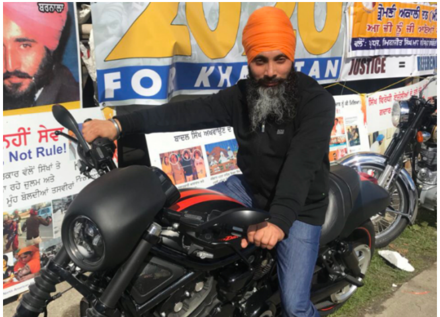
An undated photo of Hapreet Singh Nijjar, who India has accused of plotting terrorist activities in Punjab state, posing in front of a poster calling for a 2020 referendum on the creation of Khalistan.

— Sikhs For Justice (@sikhsforjustice) September 10, 2018