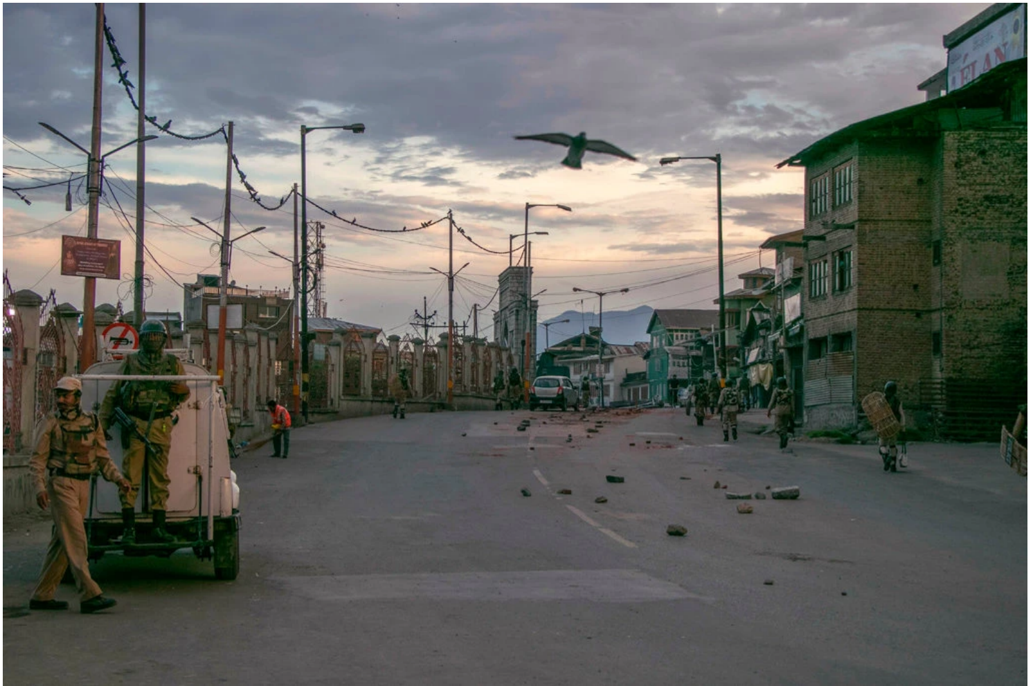
Indian security personnel patrolling an empty street in Srinagar.

Across India, most people supported the move to take away Kashmir's autonomy. Even progressive politicians who usually clash with Mr. Modi backed him on this. But in Pakistan, many people feel Kashmir should be part of their country and are infuriated by India's actions.