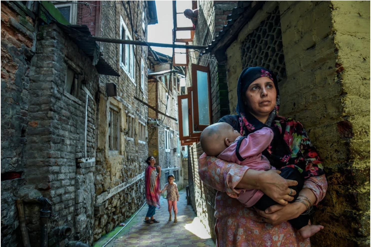
A woman with her nephew in Srinagar, in Jammu and Kashmir. Indian soldiers have forced most Kashmiris to stay at or near home.