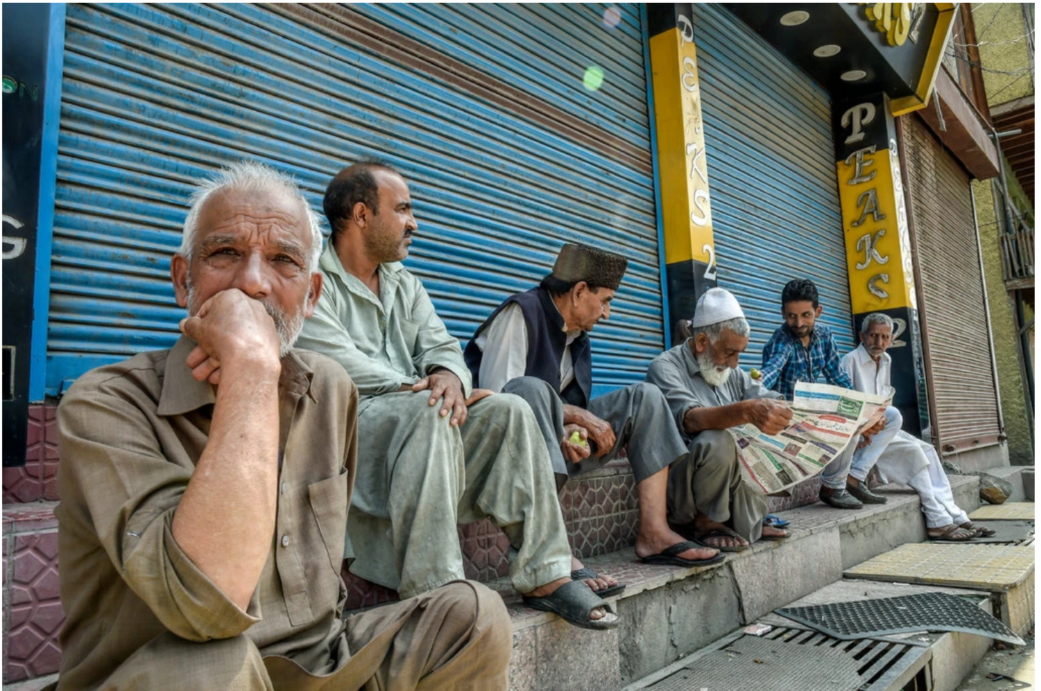
Srinagar residents on Thursday.

Many Kashmiris were shocked and demoralized by the news that their autonomy had been instantly erased. The Indian government, led by Narendra Modi, made its move on Monday, dismantling an article in the Indian Constitution that guaranteed Kashmiris special land ownership rights and allowed Kashmir to frame its own laws.