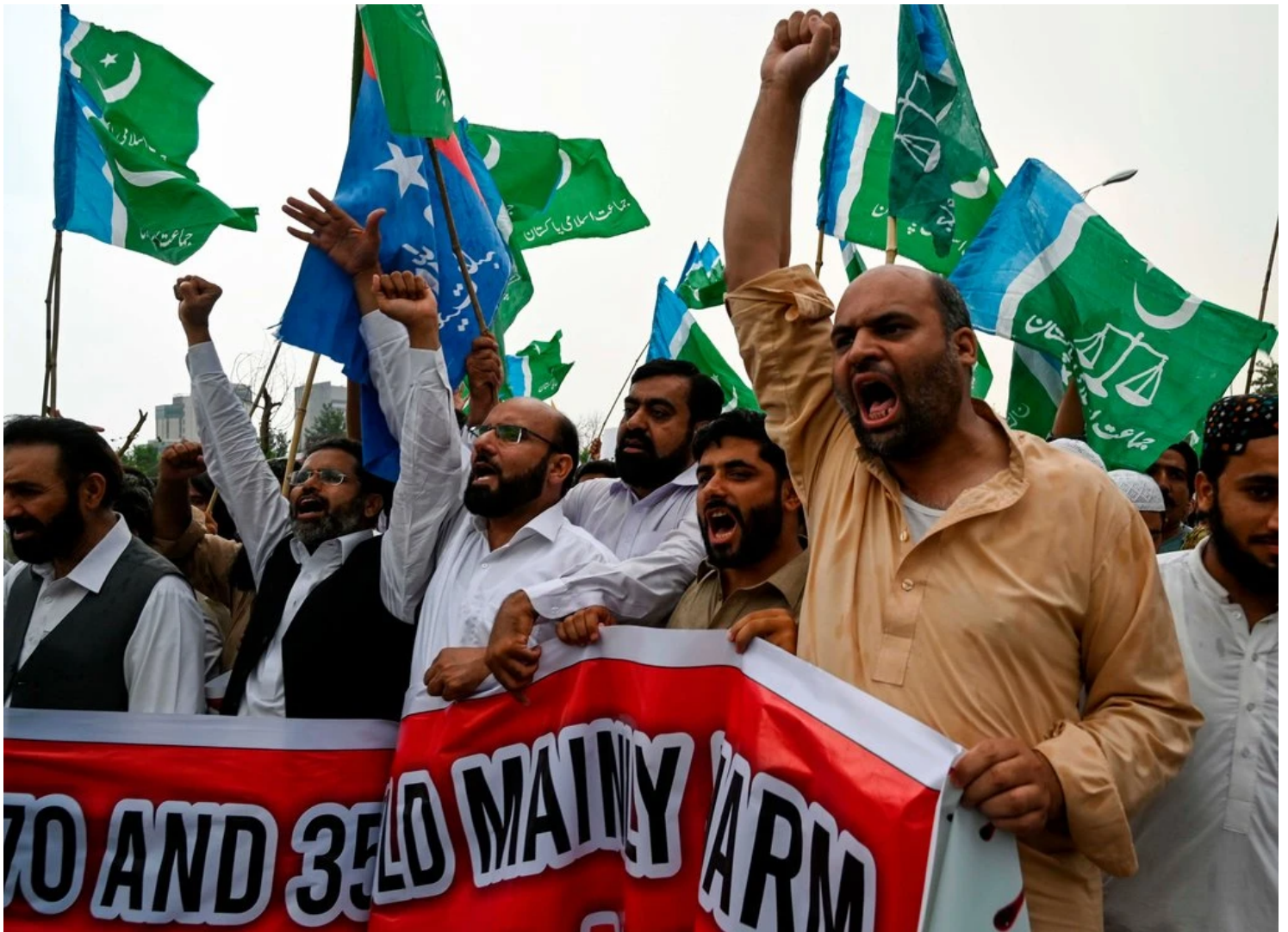
People protesting India's move in Islamabad, Pakistan.

Watching a live address by Prime Minister Narendra Modi.