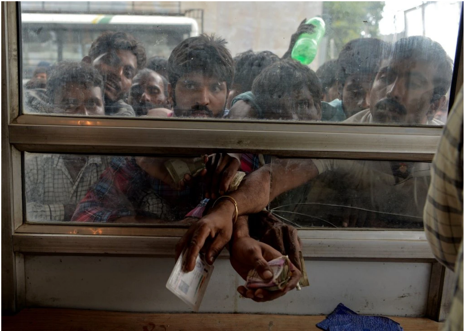
Men in Srinagar buying bus tickets to leave Kashmir.