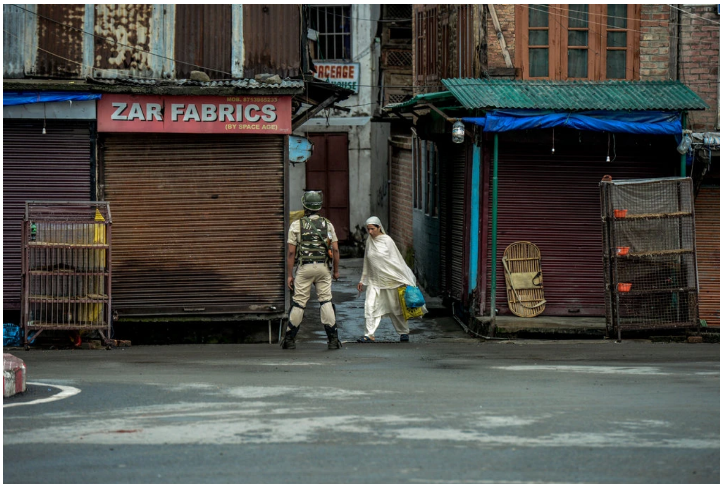
Shops remained shuttered in Srinagar on Saturday.

The one important thing the opposing sides agree on — perhaps the only thing — is that for too long Kashmir has suffered stagnation, hopelessness, squandered potential and endless killing.