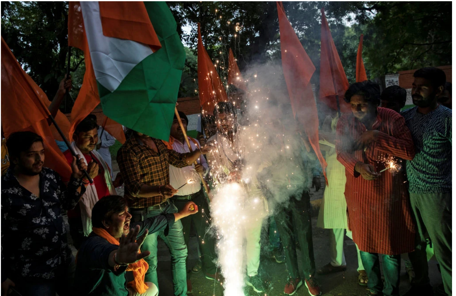
People in New Delhi celebrating the decision to revoke Kashmir's autonomy.